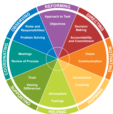
Insights Discovery Team Effectiveness Wheel

At the heart of the program is the Insights Discovery Learning System.