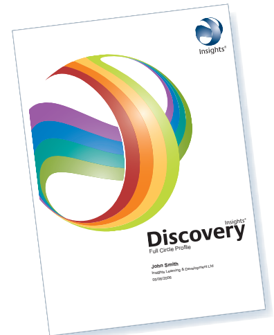
Insights Discovery Full Circle Wheel